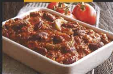
Beef Chili (With Beans)