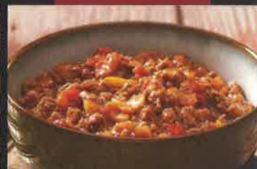
Jalapeño Beef Chili (Without Beans)