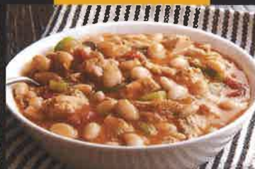
Chicken Chili (With Beans)